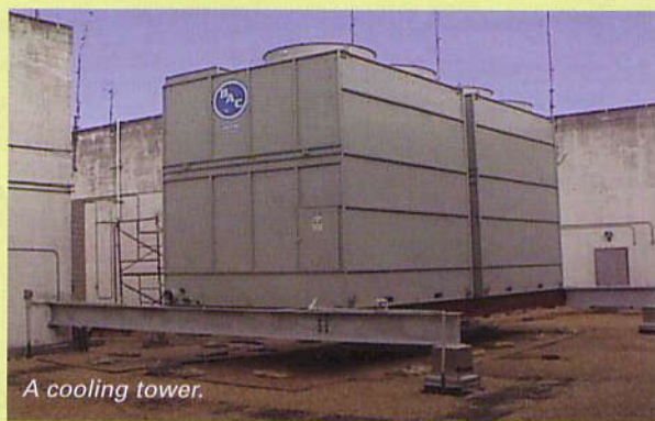
A cooling tower.

In thermal destruction, ozone is destroyed by heating it in excess of 300