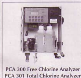
PCA 300 Free Chlorine Analyzer PCA 301 Total Chlorine Analyzer